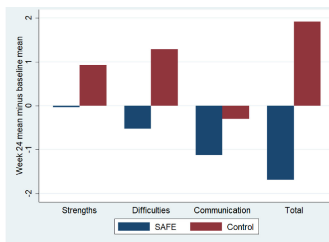
Figure 2 Mean change in SCORE-15 subcategories for SAFE+SUE (SAFE) and SUE only (control) for all family members, including children with autism, who completed the SCORE-15 at both baseline and at 24 weeks. SAFE, Systemic Autism-related Family Enabling; SCORE-15, Systemic CORE 15; SUE, Support as Usually Employed.