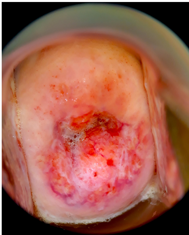
Figure 2 Cervical intraepithelial neoplasia 3 (CIN3).

sensitivity than Pap smears in detecting \geq CIN2 lesions and are only marginally lower in sensitivity than physician-obtained cervical specimens. 21 22 It would be practical for women in China to obtain self-collected HPV specimens, which would then undergo testing. Rapid, same-day testing is useful because it can decrease loss to follow-up which can be highly problematic because of geographical and transportation issues in rural regions of China. The problem of loss to follow-up was illustrated even in our same-day screen-and-treat study as 36 of 216 (16.67%) hrHPV+ women were unable to return for same-day colposcopy and 16 of the 36 women never followed up at their regional medical centre.