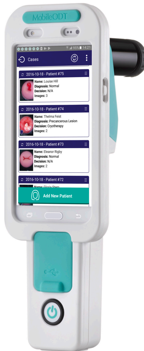
Figure 1 Enhanced visual assessment system, MobileODT.

Cervicovaginal HPV DNA testing is a reliable test for the detection of high-grade cervical intraepithelial neoplasia (CIN). 14 While typically used in conjunction with a Pap smear for traditional cervical cancer screening, the accuracy and high sensitivity for the detection of cervical dysplasia of HPV DNA testing have led to various studies investigating its use as a stand-alone screening strategy in low-resource settings. 14 Studies have demonstrated that healthcare provider-collected cervical HPV samples are significantly more sensitive and carry only a slightly lower specificity for the detection of high-grade CIN than conventional cytology. 20 Additionally, HPV DNA test swabs can be obtained by the patient alone ('self-sampling' or 'self-swab'), thereby eliminating the need for a skilled provider and equipment to perform a pelvic exam. This