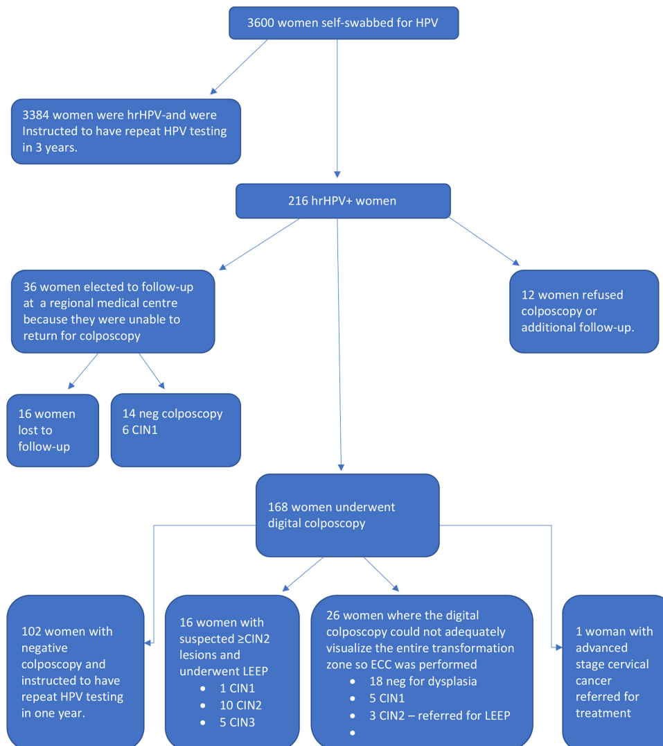
Figure 3 Study results flow chart. CIN, cervical intraepithelial neoplasia; ECC, endocervical curettage; HPV, human papillomavirus; hrHPV, high-risk HPV; LEEP, loop electrosurgical excision procedure.

by colposcopy without biopsy, as well as fewer cervical cancers, and fewer deaths than with an HPV test followed by VIA. As such, this study, and previously performed studies, suggest that WHO guidelines could be modified in countries with the necessary resources to favour digital colposcopy over VIA after HPV testing. 19