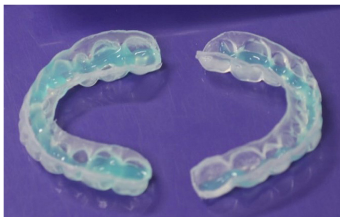
Figure 1 0.145% fluoride gel loaded in a custom tray, to be worn by the study participants at bedtime.

In 2017, regulations allowed the use of the highest concentration of 0.15% fluoride in Japan. Although it is about 1/10 of the concentration used in other countries, we aimed to obtain the same effect by extending the action time of the fluoride. First, we investigated the incidence of dental caries in head and neck cancer patients who had not received fluoride. The mean of new dental caries 1 year after RT in 31 patients with head and neck cancer undergoing RT was 2.68, while no newly developed dental caries was found in 25 patients with oral cancer who underwent surgery but not RT 1 year after the surgery. 6 Next, as a preliminary study, 13 patients with head and neck cancer undergoing RT received topical application of 0.145% fluoride gel in custom tray during sleep every day for 1 year (figure 1), and as a result no newly developed dental carious lesion was found in all 13 patients. 7 These results show that application of low concentration fluoride gel in custom trays during sleep every day is promising preventive method for radiation-related dental caries. Therefore, we conduct a randomised controlled phase III study (FluCar study) to evaluate the efficacy of low concentration fluoride gel using custom