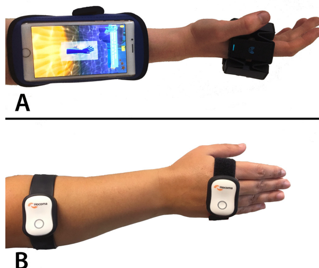
Figure 1 Sensor placement. (A) iPhone and Myo; (B) two Valedo sensors.

obtained using sealed opaque envelopes. Patients are randomised using block randomisation in blocks of four, stratified for age (18–64, and 65 years or above) and for treatment type (conservative treatment using immobilisation or operative treatment by means of internal fixation) to ensure a balanced randomisation into the two groups.