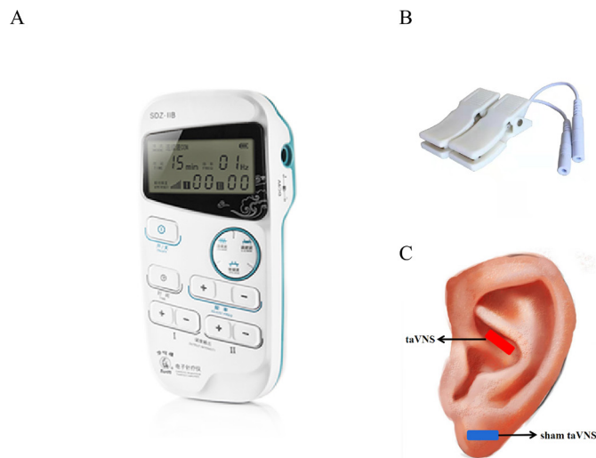
Figure 2 (A) Stimulation device (SDZIIb, Huatuo). (B) Ear clip electrodes. (C) TAVNS (cymba conchae) and sham (earlobe) stimulation locations. TAVNS, transcutaneous auricular vagus nerve stimulation.

Patients, outcome assessors and statistical analysts will remain unaware of patient study allocation. To minimise discussion of the intervention, patients in different groups will not be housed in the same hospital ward. Neither outcome assessors nor statistical analysts will be engaged in intervention administration. Assessors will avoid asking for information about the stimulation location. Group allocation will be coded (A/B) and kept in sealed, opaque envelopes by a specified research assistant. Code identifiers will be unblinded after the completion of all data analyses.