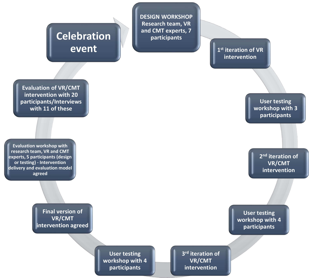
STUDY SET-UP – Supplementary flowchart 1