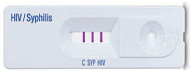
Figure 2 Bioline point-of-care test.

on themselves believing that the test is accurate and convenient. In turn, if acceptability and usability are high among both providers and users, then implementation is feasible.