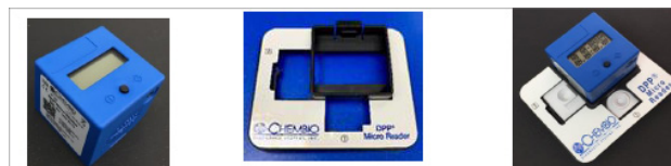
Figure 4 DPP microreader, test device holder, DPP microreader with test device holder and test device. DPP, dual path platform.

Recently, the Chembio Company developed the DPP microreader (MR) to complete the Chembio DPP technology and minimise error due to subjective visual interpretation (figure 4). The DPP MR is a portable, battery-powered instrument that uses assay-specific algorithms to analyse the test and control line reflectance to determine the presence or absence of the antibodies to HIV and/or TP in the sample. The device is fitted to the Chembio POCT via a dedicated holder. The reader verifies the presence of the control line and measures colour intensity at each of the test line positions; it interprets the results using an algorithm including assay-specific cut-off values, and reports a positive, negative or invalid result. 20