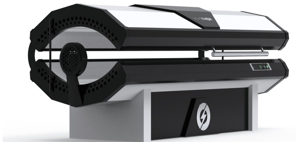
Figure 1 NovoTHOR. Reprinted with permission.