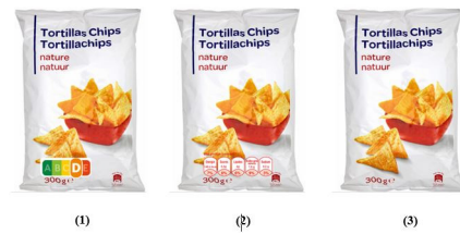
Figure 1 An example of a food product in the Nutri-Score (1), Reference Intakes (2) and no label (3) arms. Images developed by the coauthors.

For this specific purpose, an experimental online supermarket was developed, similar to previous trials. 18 28