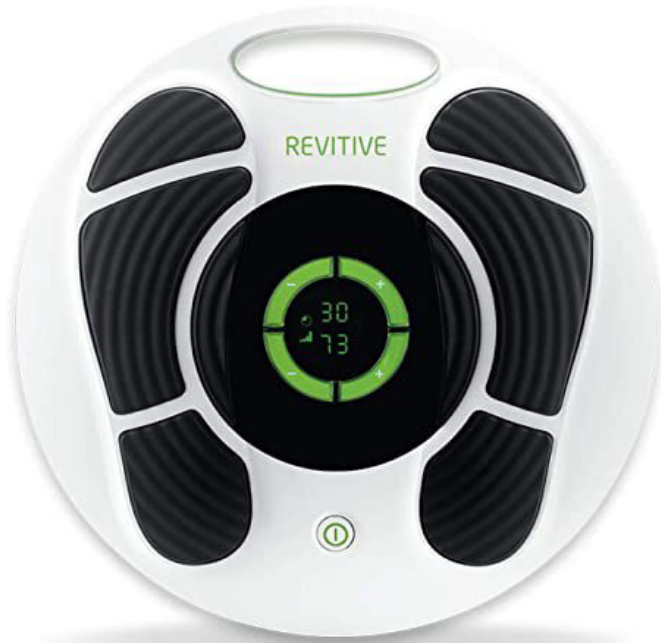
Figure 2 Neuromuscular electrical stimulation device footplate.

to familiarise with the sensation before entering into a second phase of the strengthening protocol. The quadriceps stimulation programme lasts 20 min and is detailed in the online supplemental material. Participants are instructed to use the 20-min quadriceps stimulation programme five times per week.