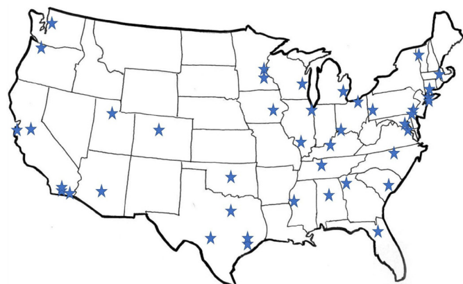
Figure 3 Pediatric Emergency Medicine Collaborative Research Committee network member sites with intent to participate in the cross-sectional cohort analysis of disparities by race, ethnicity and language proficiency in the management of low-risk febrile infants. Participation requires completion of all local and study-wide regulatory requirements.

If no institutional guideline is available, we will apply a standardised definition of low-risk (box 1). 1 2 For the purposes of inclusion in the study database, the standardised definition will use only those laboratory values that