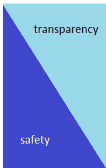
Figure 2 Transparency versus safety for learning.

Sustainable quality improvement depends on health professionals feeling safe enough to learn. At the same time, it is necessary for doctors to realise the importance of offering society insight into their daily practice and