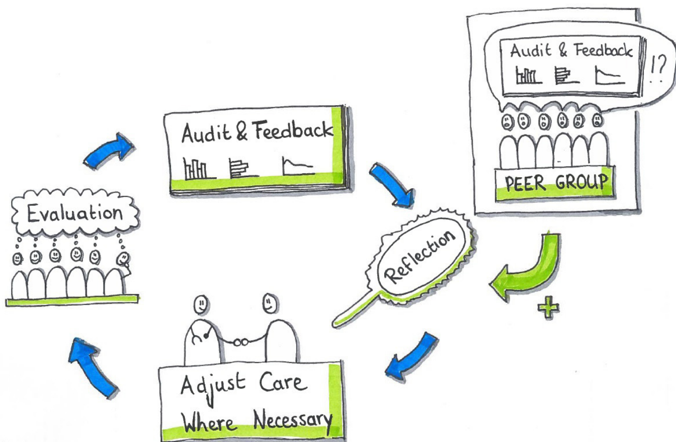
Figure 1 Infographic on group discussion of audit and feedback (AF).

Interviews and focus group discussions were audio-taped, transcribed verbatim and anonymised. Transcripts were analysed with a thematic analysis approach using MAXQDA. 25 32 The first three transcripts were analysed by two researchers (DvdW and JB) using open coding. Next, the two code trees were compared and discussed in detail, resulting in one preliminary code tree. DvdW coded the