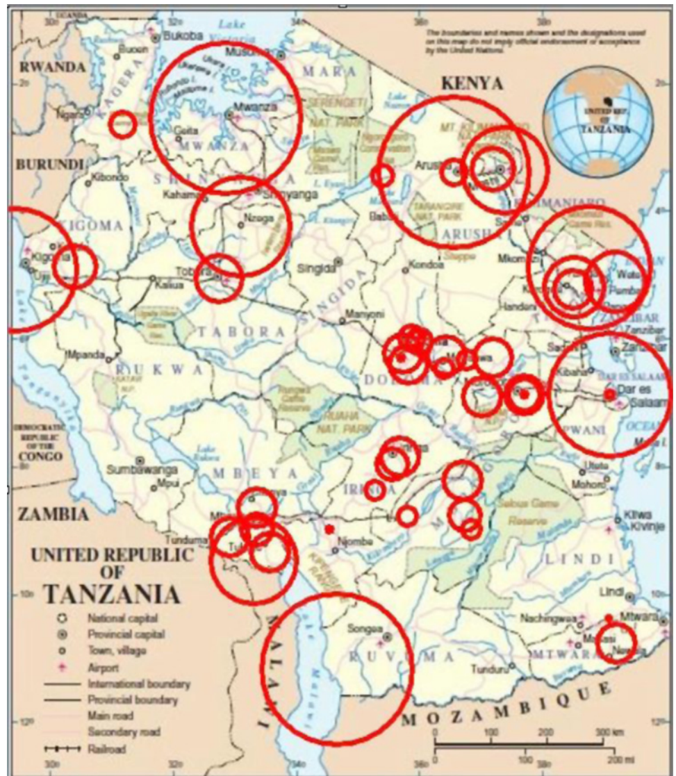
Figure 1 Facilities evaluated. Ring size proportional to population served.

low-income countries for patients with surgically treatable conditions. An estimate of the global burden of surgery showed that only 26% of estimated surgical procedures were performed in low-income countries, despite these countries accounting for 70% of the global population. 2 Of the estimated 536 000 maternal deaths in 2005, developing countries accounted for 99% of these deaths 6 ; much of this mortality could be prevented by timely access to emergency and basic surgical services.