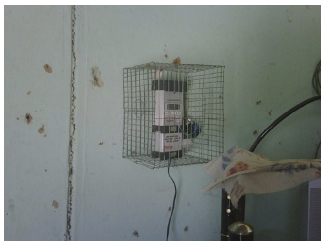
Figure 3 Particulate matter measurement device in place. pDR-1000 in place in study household, accompanied by HOBO Data Logger and protected by open cage for air flow.

Of the 1851 potential participants listed on our censuses and approached across both sites, a total of 1441 adolescents were recruited to participate in the study, 725 in Lima and 716 in Tumbes. In Lima, 321 (30.4%) refused participation or were unable to be contacted,