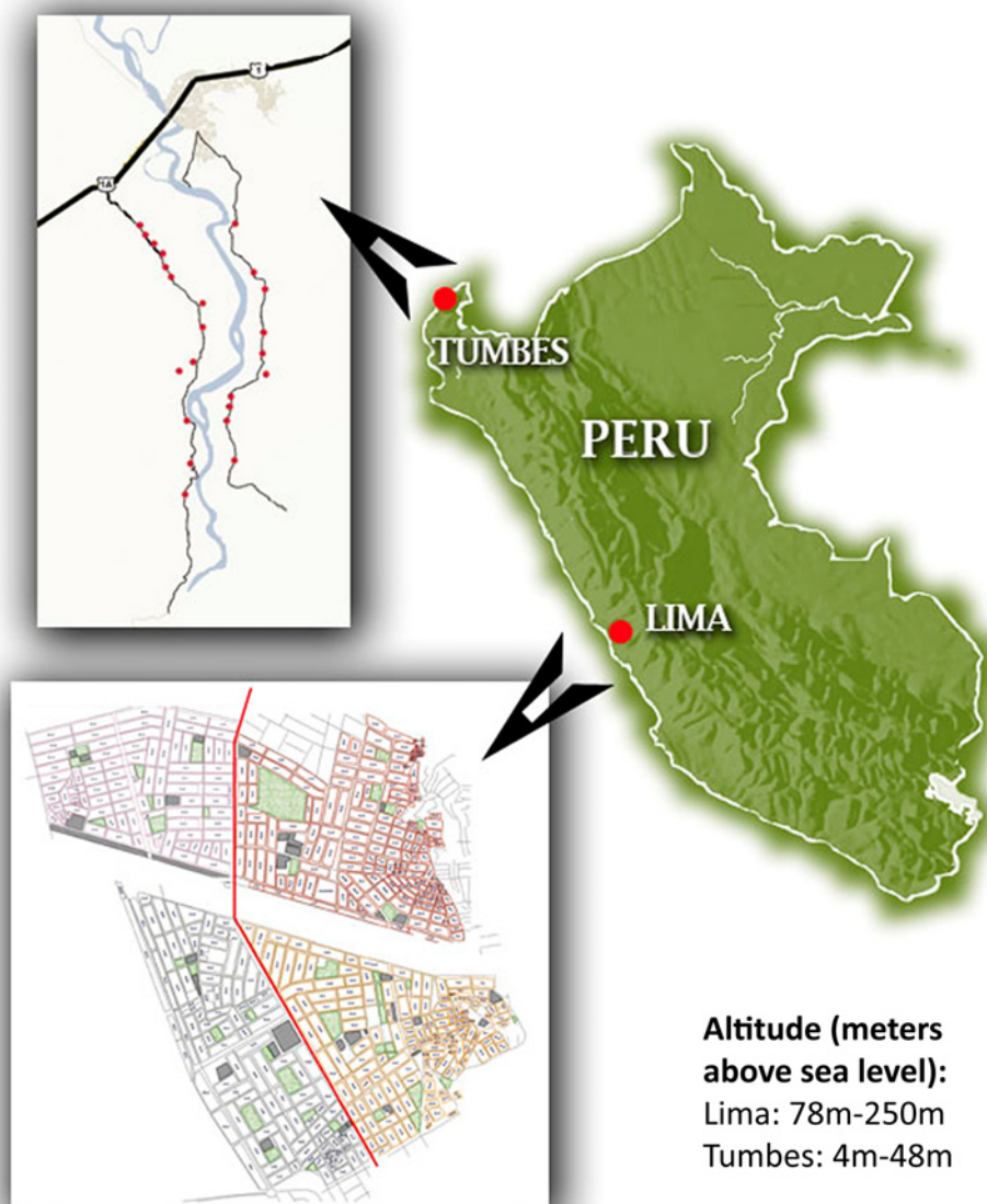
Figure 2 Map of Peru and study sites. Lima, Peru (n=725) and Tumbes, Peru (n=716) are coastal regions and thus of low altitude. Inset of Lima shows Pampas de San Juan neighbourhood divided into quadrants by main thoroughfare (vertical red line). Pampas de San Juan is set on a large hill, with base to the west and peak to the east. Inset of Tumbes shows 23 rural study towns set along small roadways on east and west margins of the Tumbes River. City of Tumbes at crossing of major highway (thick black line) and river (light blue).

in genetic admixture and differences in the distributions of SNPs associated with asthma between these two populations.