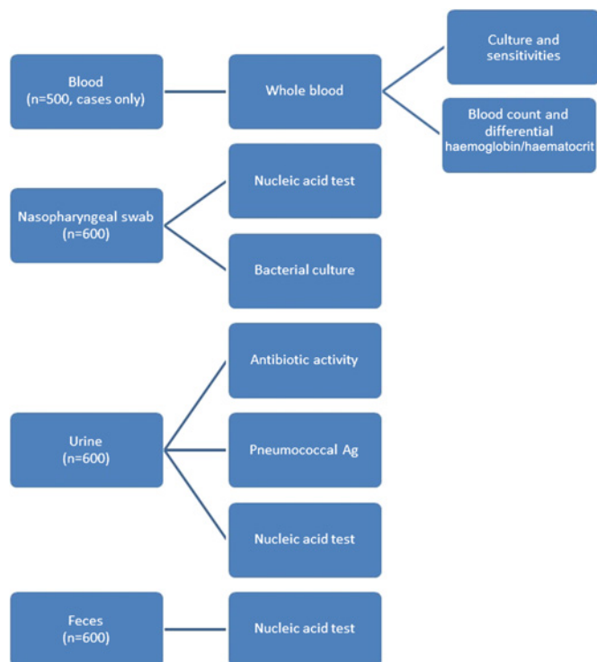
Figure 2 Microbiology testing schematic.

We will adhere to hospital procedures for avoiding hospital-acquired infections. We will wash hands with soap and water or alcohol-based hand sanitizer before patient contact. We will wear gloves, gowns and mask when required. We will clean the devices using alcohol swabs before and after each use.