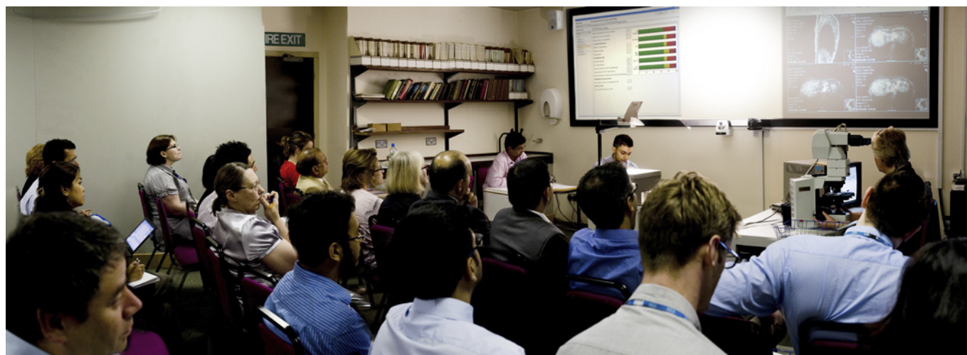
Figure 1 MATE (Multidisciplinary meeting Assistant and Treatment sElector) in use at Royal Free breast multidisciplinary team meeting.

a major opportunity for identifying patients who are eligible for participation in clinical trials. 15