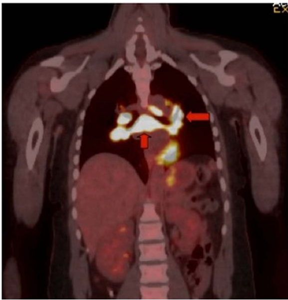
Figure 2 Positron emission tomography/CT (coronal view) of symmetrical hypermetabolic mediastinal and hilar lymph nodes (arrows).

treatment regimens for all patients with sarcoidosis were obtained from the electronic medical record and telephone calls placed to the patients or their immediate family.