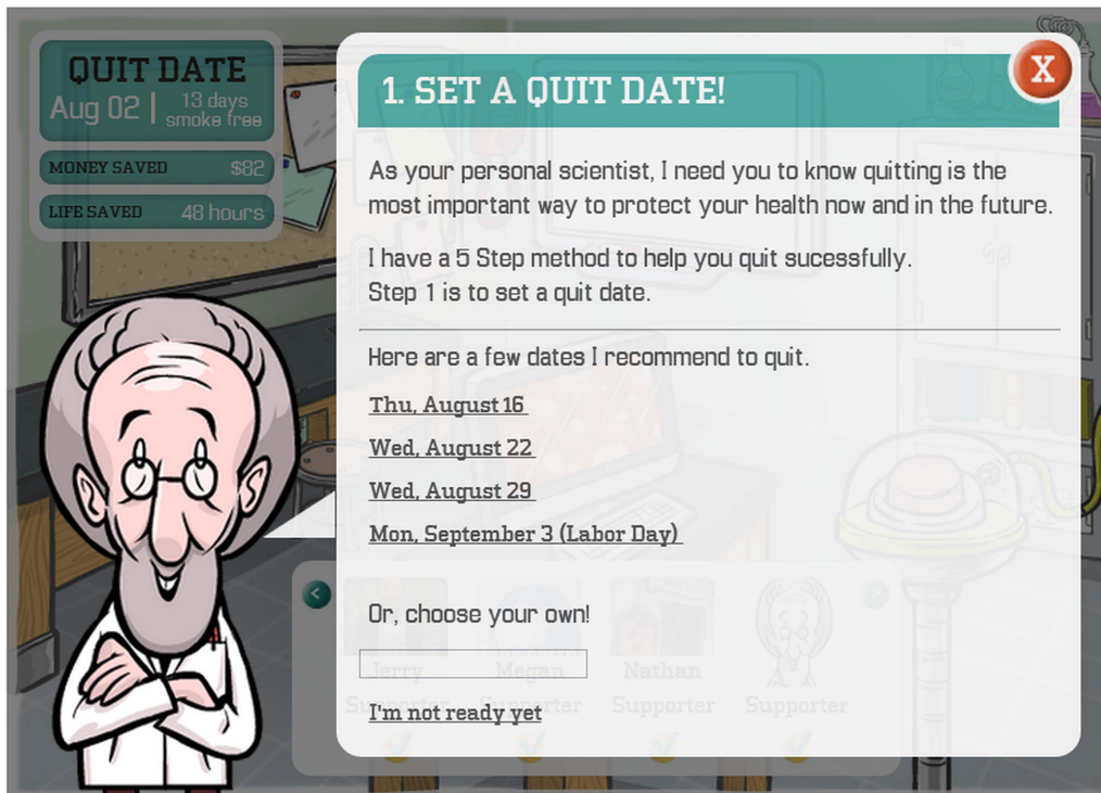
Figure 3 Application Quit Date Wizard.

as they nominate as buddies or with whom they actively communicate. 20-29 The app leverages this network phenomenon by manipulating sharing and competition-driven app use to drive contagion, both of which map