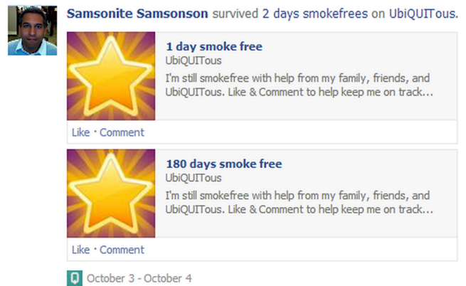
Figure 1 Facebook Timeline.

This study aims to identify the variables that drive adoption and dissemination of an intervention throughout a network. The study examines this question within Facebook, the single largest and fastest growing online social network. As of 2013, approximately 143 million Americans use Facebook daily, with users globally sharing an average of 4.7 billion items of content daily. 28 Facebook enables individuals to create a profile, identify other members who are friends, exchange messages through multiple channels and—most relevant to this study—install small applications ('apps') created by third parties. These apps rely on 'viral' diffusion to grow their user base, and achieve this by inducing users to