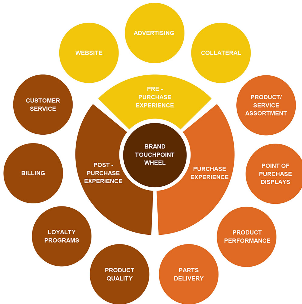
Figure 1 The brand touchpoint wheel. Source: Dunn and Davis. 35

self-employed status (trigger to vaccination). The participant then reported that at that stage he had tried to get a flu vaccine at a pharmacy, but it was out of stock (touchpoint and trigger away from vaccination). Finally, the participant remembered that the vaccine could have side effects and decided to stop trying to get vaccinated