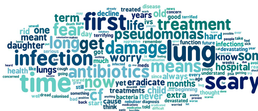
Figure 3 The most commonly used words in response to question 2.

uncertainty affects their ability to make plans, “It means worrying about letting people down,” 367 ( patient ).