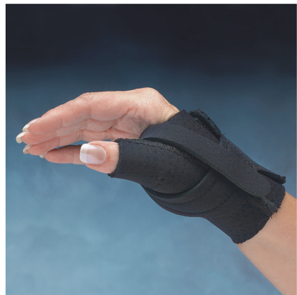
Figure 2 Comfort Cool Thumb CMC Restriction Splint.

While favourable results have been observed with different types of splints, prefabricated types are preferred over the custom-made version by most patients. 13 Moreover, different ways of using the splint have been studied. A systematic review of design and effects of splints identified two trials with low risk of bias in which best results were achieved with the use of splints during daily activities. 14 28 A prefabricated neoprene splint (Comfort Cool Thumb CMC Restriction Splint) will be used in this study. This splint is readily commercially available and does not require any customisation, facilitating potential dissemination post study, generalisability of our findings and application in routine clinical practice. The splint incorporates the base of the thumb and wrist and participants will receive recommendation to use it during activities of daily living (minimum of 4 hours/day) for 6 weeks (figure 2). The splint will be removed during rest, sleep, exercises and bathing.