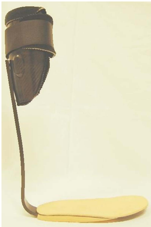
Figure 2 The experimental AFO. The stiffness of the AFO can be varied by exchanging the dorsal leaf spring. In total, five different springs (ranging in stiffness from very flexible to very stiff) will be assessed. AFO, ankle-foot-orthosis.

The optimal AFO will be worn by the patient according to an accommodation schedule that includes a gradual increase in the length of time the AFO is worn. Patients will be contacted 1 week after wearing the optimal AFO to check for adverse events (eg, pain or pressure sores).