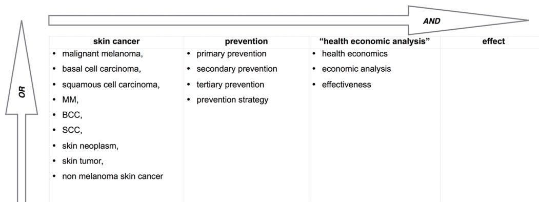
Figure 3 Searching terms for key question 2.

Articles identified through reference lists in included studies, grey literature, and bibliographic searches will also be considered for data collection based on