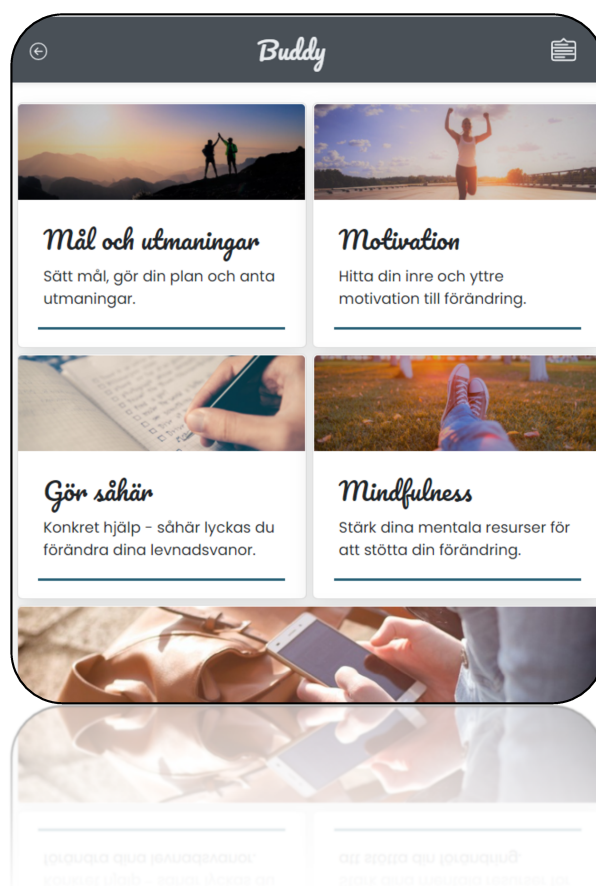
Figure 2. A screenshot of the BUDDY intervention showing the main menu